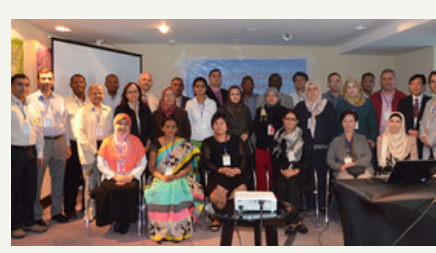
Abu Dhabi, UAE, 2013.11.17-18