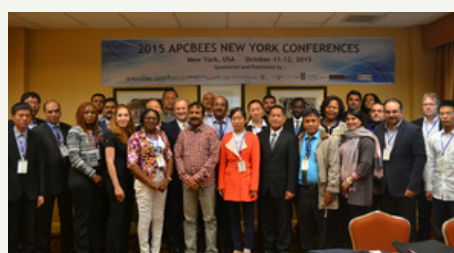
New York, USA, 2015.10.11-12