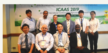
Hawaii, USA, 2019, 10.18-20