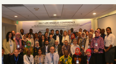
Los Angeles, USA, 2017.10.25-27