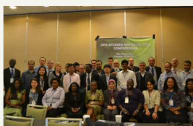
San Diego, USA, 2014.10.29-30