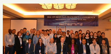
San Francisco, USA, 2016.10.26-28