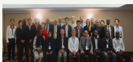
San Diego, USA, 2018, 10.29-31